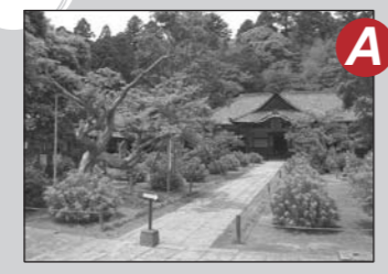
A Jisshoin Temple Affiliated to the Soto zen school, this temple was founded in honor of Maeda Toshiharu whose gravestone still lies in the adjoining garden along with all of his successors'. Sometimes referred to as the "Hagi temple", its September bush clovers are particularly praised by its visitors. Open: 9:00 to 17:00/¥400 Tel: 0761-72-1104