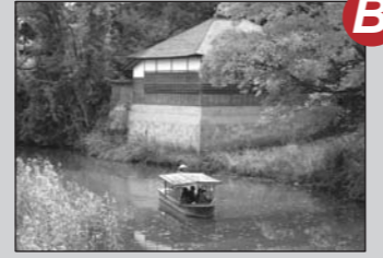
B Choryutei This pavilion built on the banks of the river was used as a resting place for the Daishoji clan lords. It is often said that they would enjoy fishing from throughout the windows or have a relaxing time in there while having tea. The building is registered as an important national asset from the Edo Period. Open: 9:00 to 16:00/¥400 Tel: 0761-72-0551 (reservation required) Closed on holidays and January 1st/2nd/3rd