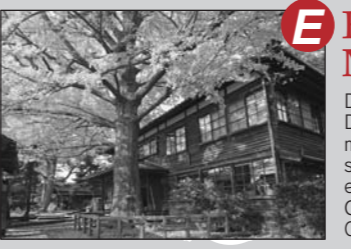
E Fukata Kyuya Memorial Museum Dedicated to the life and work of Fukata Kyuya, a native from Daishoji and beloved author of the best-seller "100 famous mountains of Japan", this nice house from the Meiji period also serves as an exchange space for mountain and great nature enthusiasts. A tea salon is also available. Closed on Tuesdays (except holidays) Open: 9:00 to 17:00/¥300 (Last entry: 16:30) Tel: 0761-72-3313