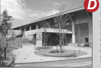
D Kutaniyaki Art Museum Encompassing a beautiful inner garden, the Kutaniyaki Art Museum celebrates the colorful art of the Kutani Porcelain which originated in the area in the 17th century and evolved to cover a wide range of styles and approaches. A cozy tea salon at the second floor welcomes you for a coffee break. Closed on Mondays (except holidays) Open: 9:00 to 17:00/¥500 (Last entry: 16:30) Tea salon running independently Tel: 0761-72-7466