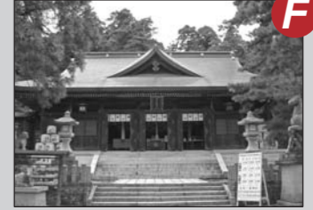
F Sugo Isobe Shrine One of the oldest shrines in the area with a history going back to medieval times, the Sugo Isobe Shrine was strongly linked to the Kaga feudal lords in honor of whom celebrations and festivals were performed here. Tel: 0761-72-0412