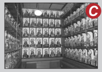
C Zenshoji Temple The famous poet Matsuo Basho stopped by this zen temple and composed a haiku inspired by the garden's willow tree. The temple is also noteworthy for its collection of Buddha disciples small statues carved with a thorough sense for facial physiognomy. Open: 9:00 to 17:00/¥500 Tel: 0761-72-1164